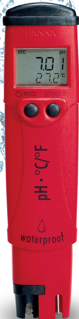
Illustration shows High Range Tester HI 98128

Exposed temperature sensor provides fast response time