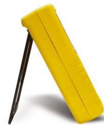
Clamp Probe, A1, A2, A3 CP-1201