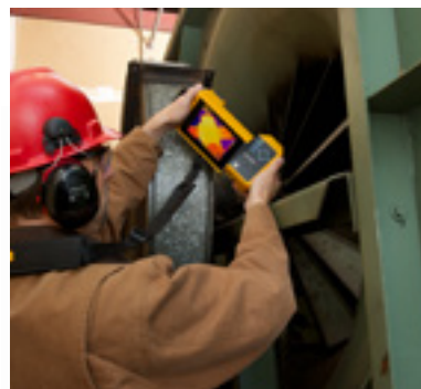
Get tough shots from any angle with a 180° degree rotating lens and the only 5.7 inch LCD.