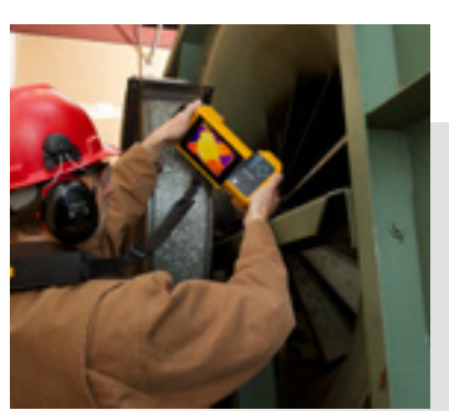
Get tough shots from any angle with a 180° degree rotating lens and the only 5.7 inch LCD.

<sup>3</sup>Compared to a 3.5 inch screen.