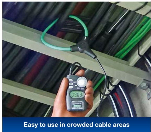
Easy to use in crowded cable areas