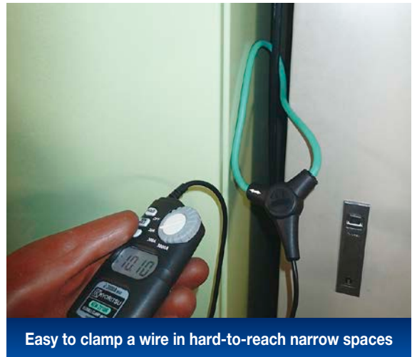
Easy to clamp a wire in hard-to-reach narrow spaces