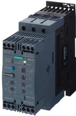
SIRIUS soft starter S2 63 A, 30 kW/400 V, 40 °C 200-480 V AC, 110-230 V AC/DC Screw terminals