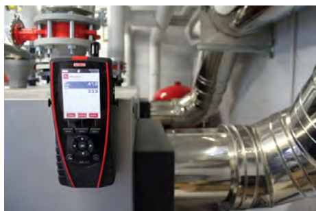
Climatic conditions measurement

AMI 310 SK : portable supplied with a ±500 Pa pressure module, a telescopic hotwire probe with gooseneck, a Ø6 mm Pitot tube, 2 x 1 m of silicone tube, a stainless steel tip