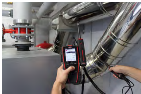
Hygrometry and air velocity measurement