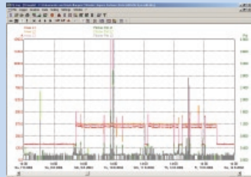
For root cause analysis, different measurements such as flicker, voltage and THD can be shown in the same time plot, helping to quickly identify the cause of a disturbance.

With its easy-to-use interface, the included PQ Log software assists you with logger setup, enables you to verify actual measurement values quickly using the online function, and downloads data from the logger to a connected PC operating on standard Windows® operating systems. You can view the logged data in graphical and tabular form, export it to a spreadsheet, or generate a professional report with the Report Writer function.