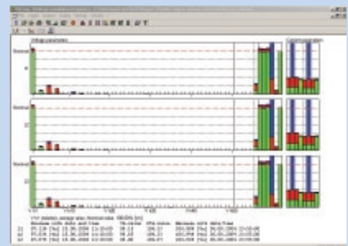
Statistical analysis of Voltage and Current harmonics over a given time period. Red bar graphs indicate issues with the grid. Other colors are warnings for potential future issues. Harmonics can be presented also as time plots.