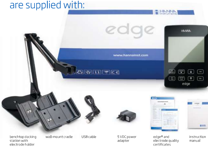
benchtop docking station with electrode holder

All edge® single parameter meters are supplied with: