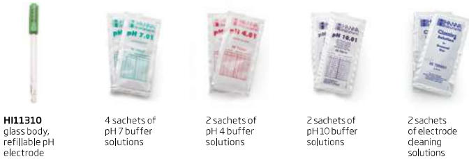
HI11310 glass body, refillable pH electrode

edge® pH kit: HI2020-01 (115V) and HI2020-02 (230V) also includes: