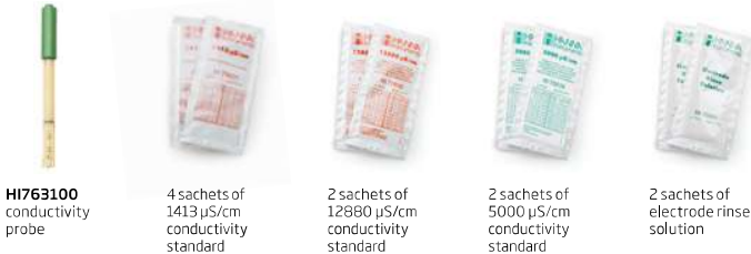
HI763100 conductivity probe

edge® EC kit: HI2030-01 (115V) and HI2030-02 (230V) also includes: