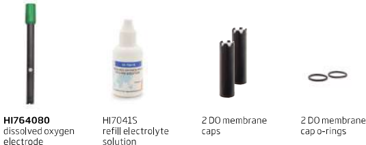
HI764080 dissolved oxygen electrode

edge® DO kit: HI2040-01 (115V) and HI2040-02 (230V) also includes: