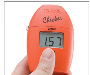
Press the button and read the results. it's that easy!