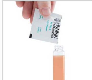
Add reagent to your water sample