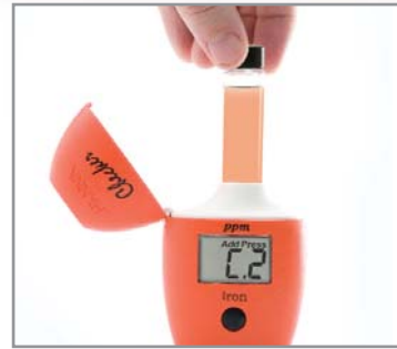
Place the vial into your Checker®HC