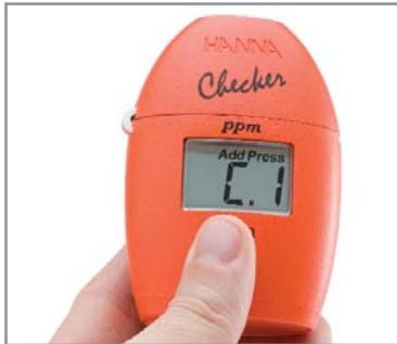
"Zero" the Checker®HC with your unreacted water sample