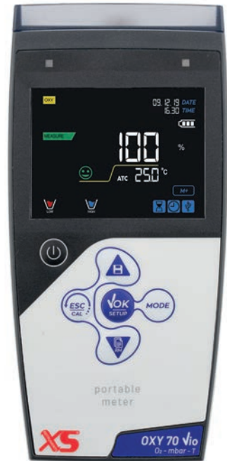
Only 6 buttons to easily manage all the functions of the instrument.