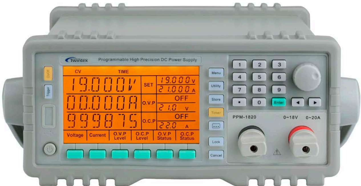
(Rated Current >10A )