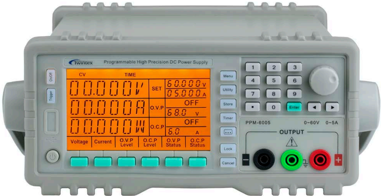
(Rated Current \leq 10A )