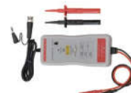
UT-P30 Differential probe 100MHz 800V