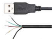
UT-D16 USB single-head connecting wire