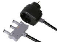
UT-S10 Wattmeter adapter socket