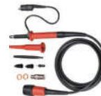
UT-P20 Passive probe 250MHz 1500V