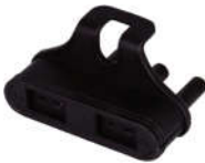
UT-S07 Temperature adapter socket