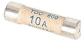
UT-F02 Cartridge fuse (fast fuse porcelain tube)