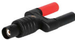
UT-S09 BNC test wire adapter socket