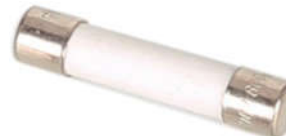
UT-F08 Cartridge fuse (fast fuse porcelain tube)