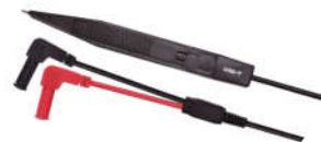
UT-L01 Tweezers test leads