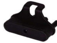
UT-S06 Power adapter socket