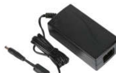
UT-W05 Power adapter