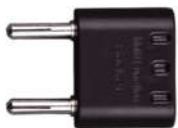
UT-S01B Multifunctional adapter socket