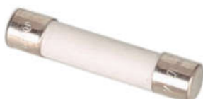
UT-F10 Cartridge fuse (fast fuse porcelain tube)