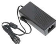
UT-W01 Power adapter