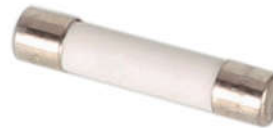
UT-F06 Cartridge fuse (fast fuse porcelain tube)