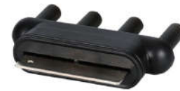
UT-S08 UT612 adapter socket