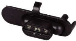
UT-S05 Multipurpose standard adapter socket