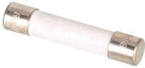
UT-F01 Cartridge fuse (fast fuse porcelain tube)