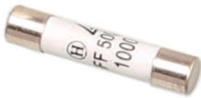
UT-F03 Cartridge fuse (fast fuse porcelain tube)