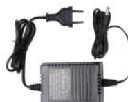
UT-W04 Power adapter