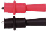
UT-C05A (M4) threaded bore alligator clip (with protector)