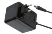
UT-W03 Power adapter