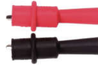
UT-C05B Through hole alligator clip (with protector)