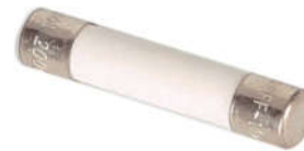
UT-F04 Cartridge fuse (fast fuse porcelain tube)