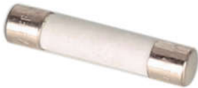
UT-F05 Cartridge fuse (fast fuse porcelain tube)