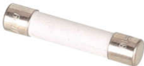
UT-F07 Cartridge fuse (fast fuse porcelain tube)