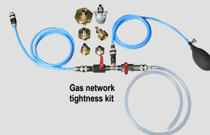
Gas network tightness kit

1 Please see the technical datasheet of accessories for kigaz for further details