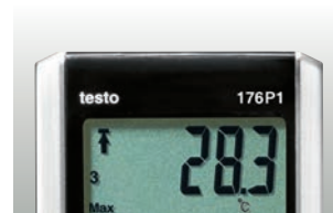
Large, clear display for showing measurement values