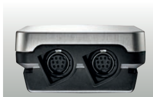
Probe connection at lower end of housing for two temperature/humidity probes