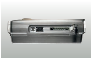
Lateral connection of Mini USB cable and SD card

* Not for condensing atmospheres. For continuous applications in high humidity (>80 %RH at ≤30 °C for >12 h, >60 %RH at >30 °C for >12 h), please contact us via our website.