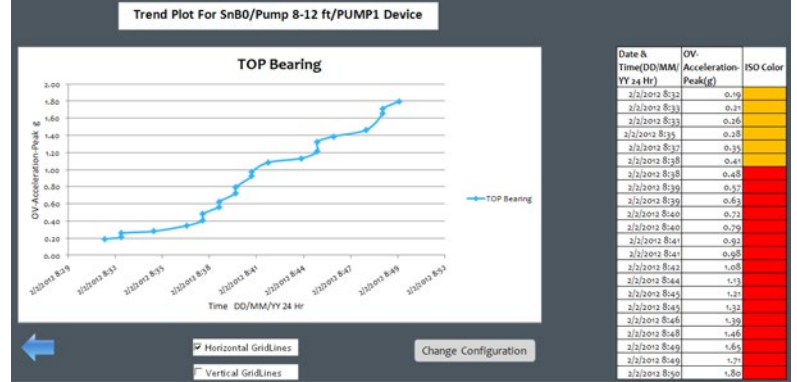
Sample trend plot using the Fluke 805 trending template.

In order to overcome this limitation, Fluke uses a proprietary algorithm known as Crest Factor + (CF+). CF+ values range from 1 to 16. As the bearing condition worsens, the CF+ value increases. To keep things simple, Fluke has also included a four-level severity scale that identifies the bearing health as Good, Satisfactory, Unsatisfactory or Unacceptable.